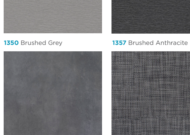
1348 Woven Graphite