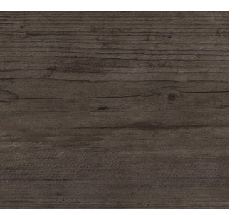
1372 Rustico Dark