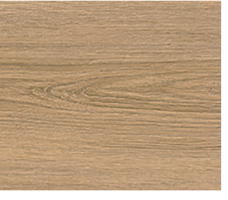
1318 Oak Nature

With a wear layer of 0.7mm it can be installed in the most demanding environments. Being looselay, means it offers an excellent solution for fast track, easy installations in busy areas. Sub-floor preparation time is often reduced and it can be easily paired with carpet tiles, to create a seamless transition. Ideal for zoning off different areas in a practical and aesthetically pleasing way.