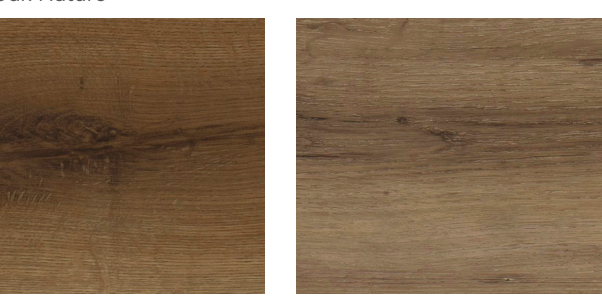
1362 Oak Russett