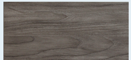
Axis Grey Ash