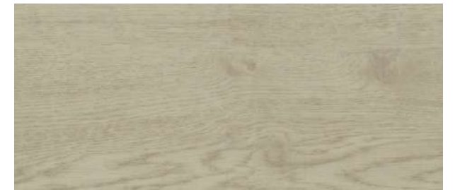
1714 Dove Grey