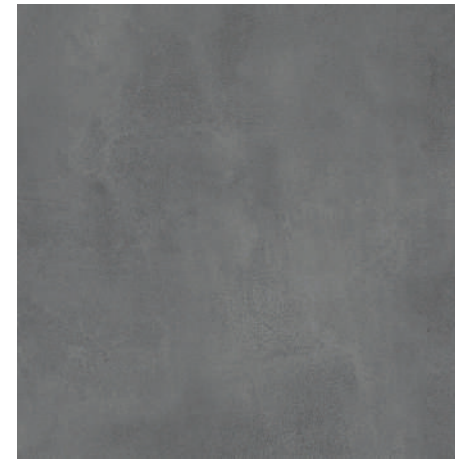
1747 Concrete Mist