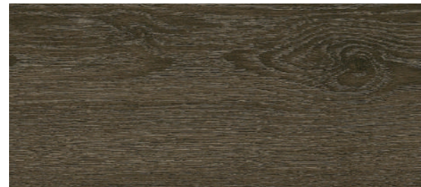
1738 Mocha Oak

ESPRESSA is a range of loose lay tiles that replicates the attractive natural effects found in wood and stone.