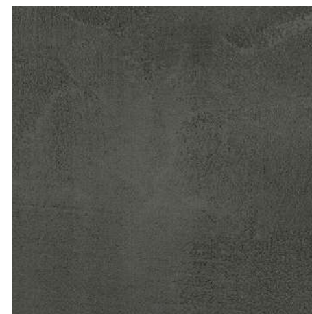
1752 Concrete Graphite