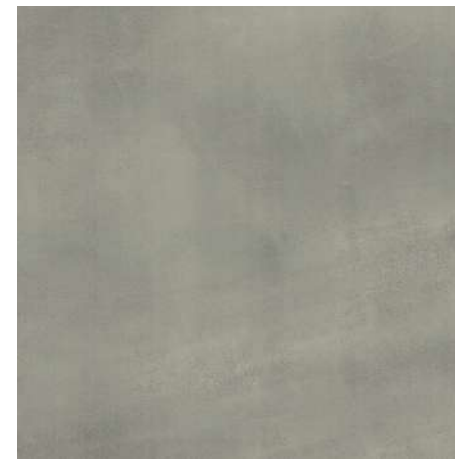
1743 Concrete Ash