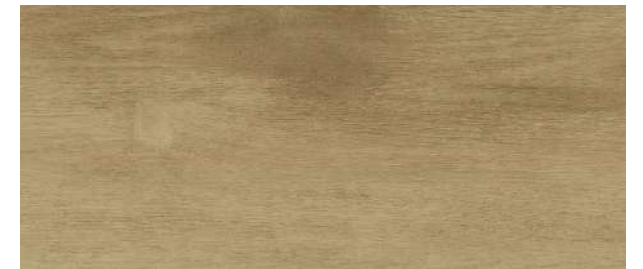
1725 Honey Grain