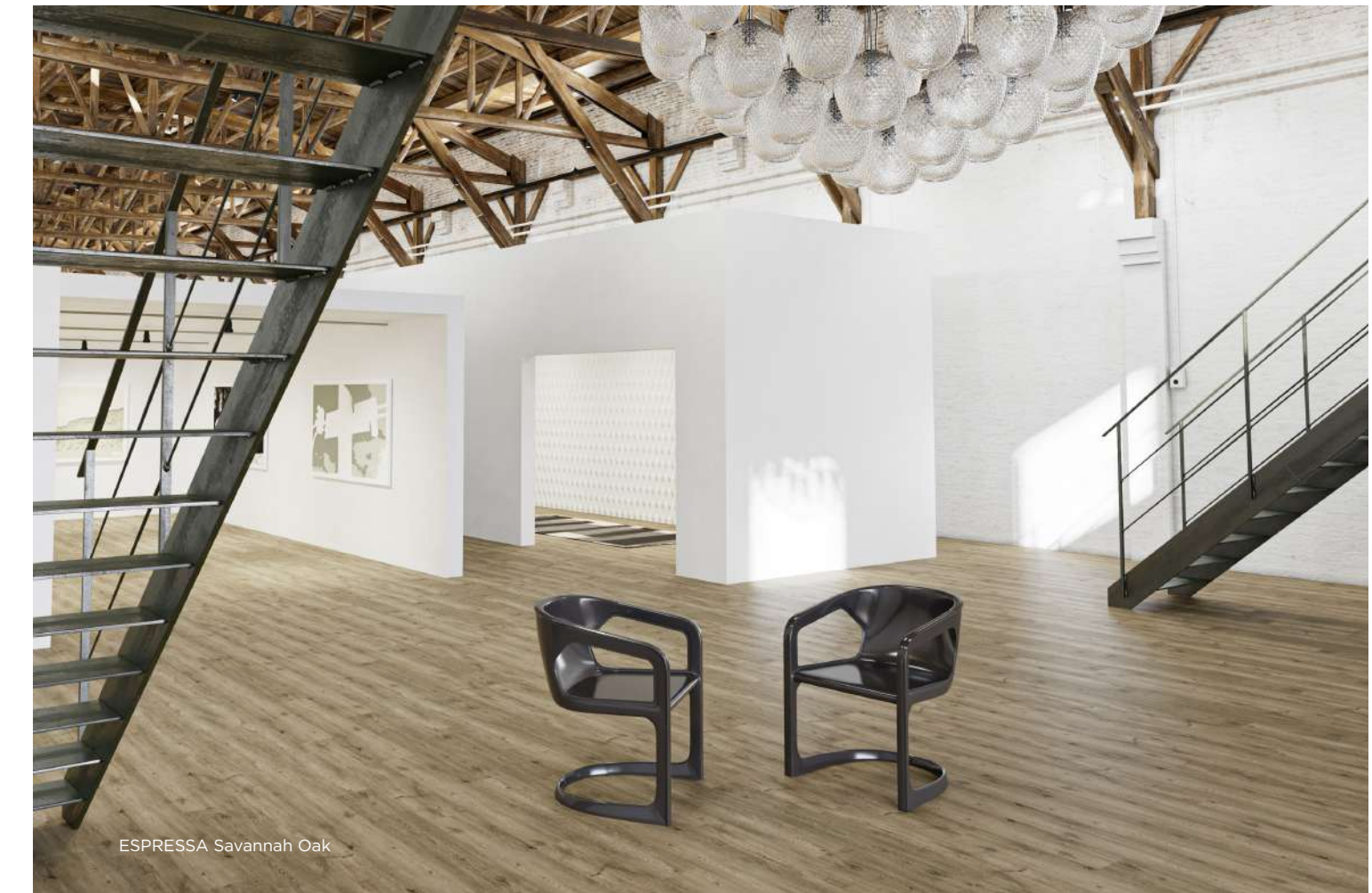
ESPRESSA Savannah Oak

Being loose lay means installation is fast and easy, and with a wear layer of 0.7mm and an R10 slip-rating, the range is perfect for heavy traffic areas.