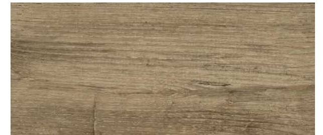
1716 Savannah Oak

Created specifically with the needs of the interior designer in mind. We understand the importance of making a good first impression; and the ability to instantly create a stunning look that will stand the test of time.