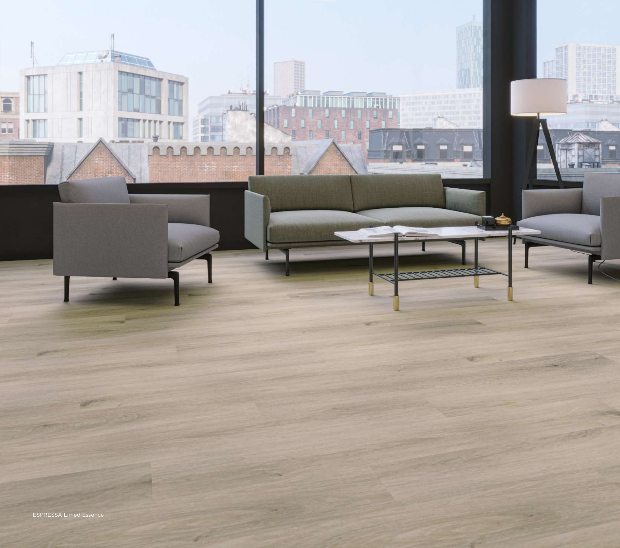
ESPRESSA Limed Essence

We are able to offer a fast turnaround and the Espressa range matches many of the design and specification requirements of a busy commercial environment.