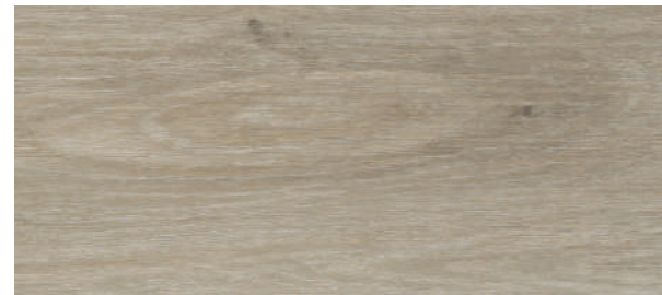
1736 Limed Essence