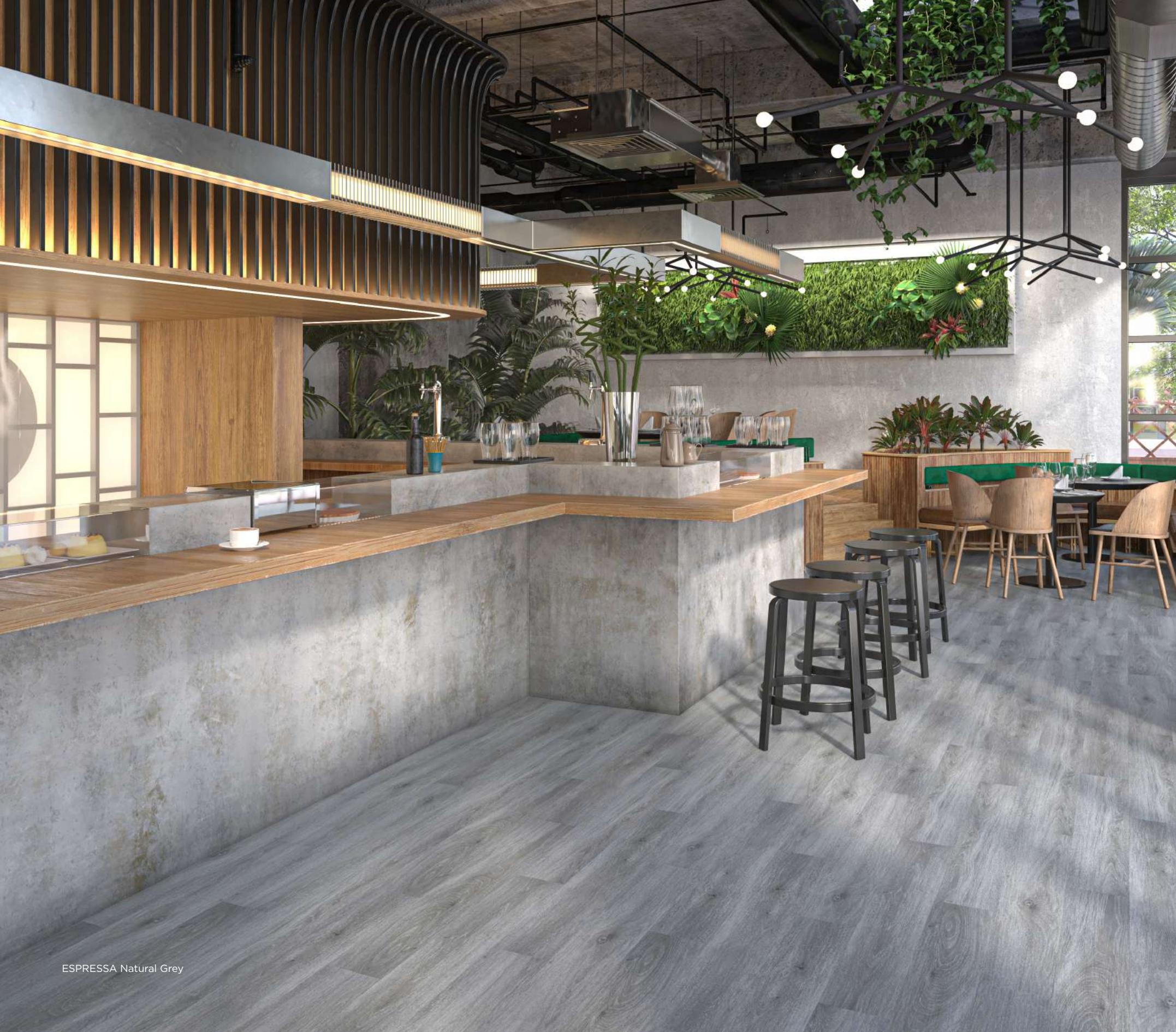
ESPRESSA Natural Grey