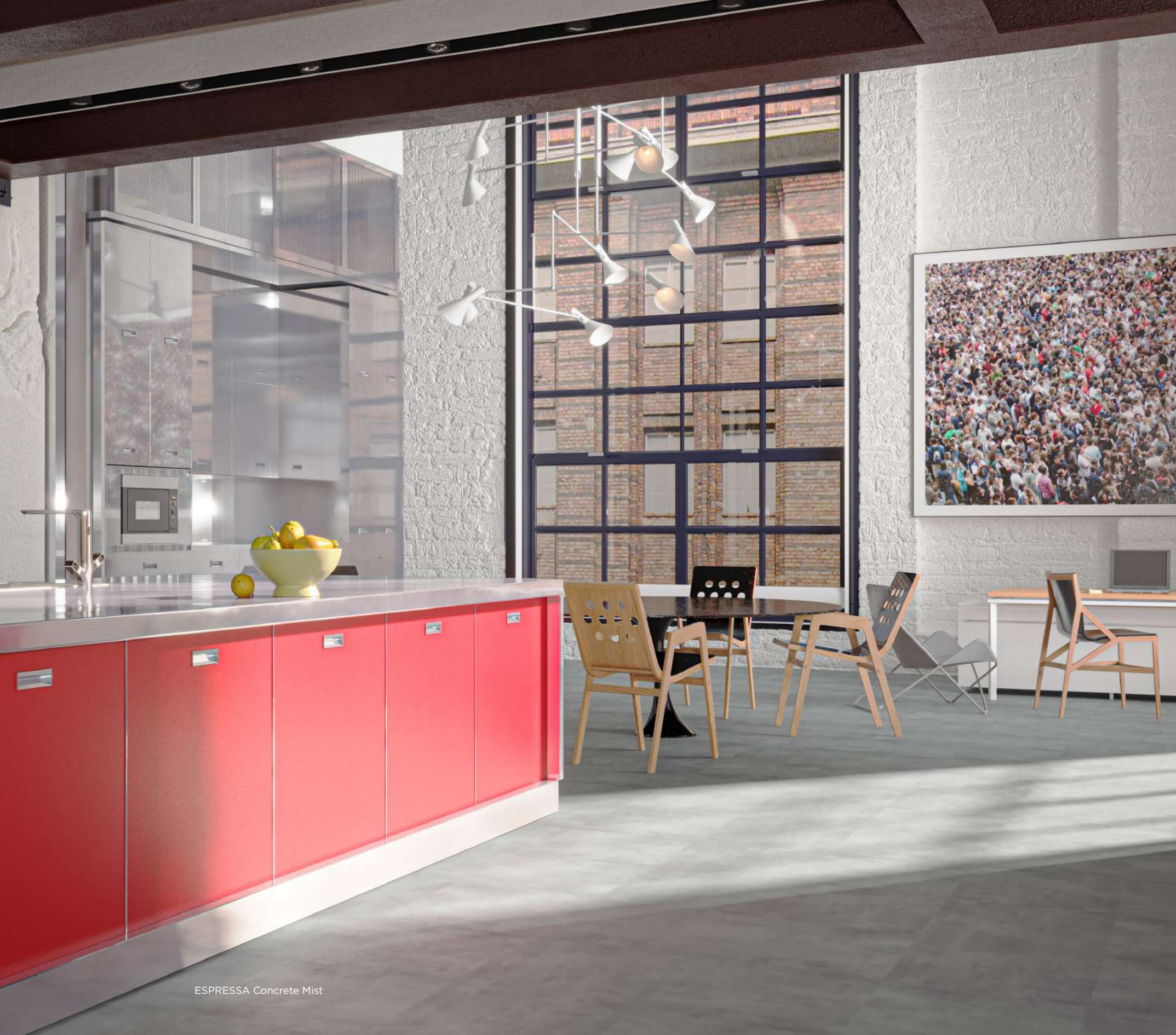
ESPRESSA Concrete Mist