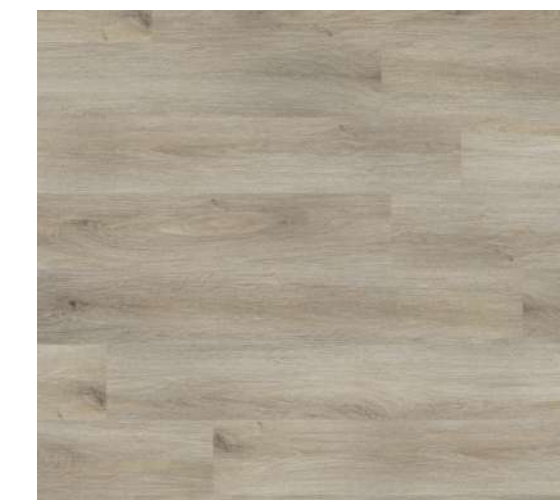
1736 Limed Essence