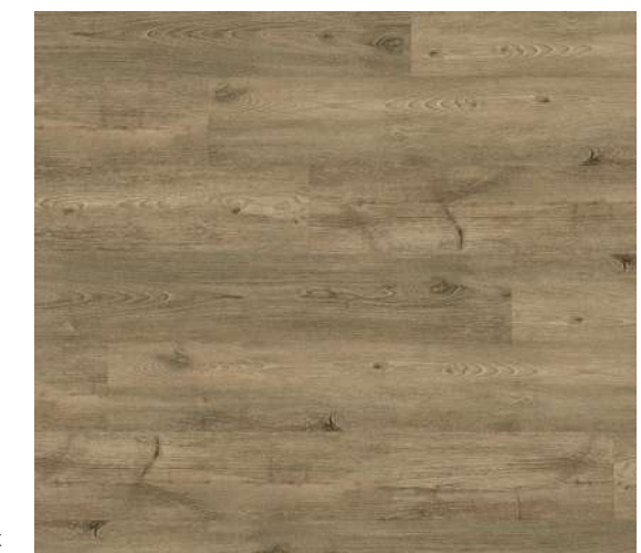
1716 Savannah Oak