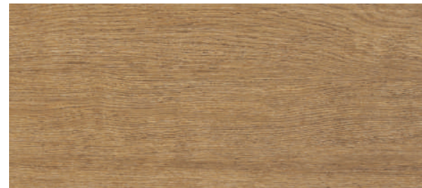
1718 Timeless Oak