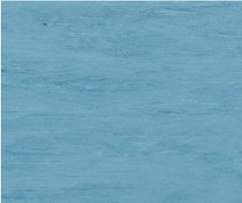
5019 Caribbean Blue