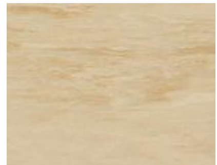
5069 Warm Sand