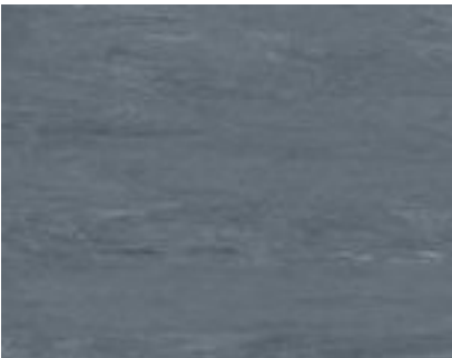
5027 Dark Platinum