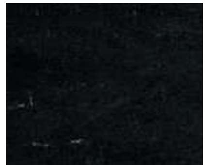
5016 Midnight Black