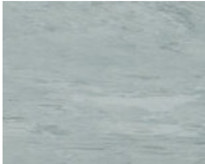
5034 Cool Grey