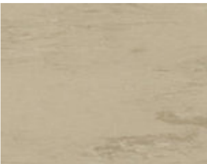
5049 Tuscan Beige