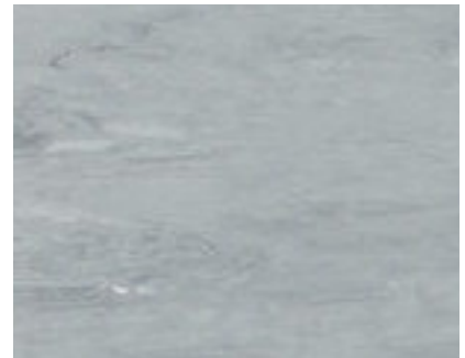
5023 Slate Grey