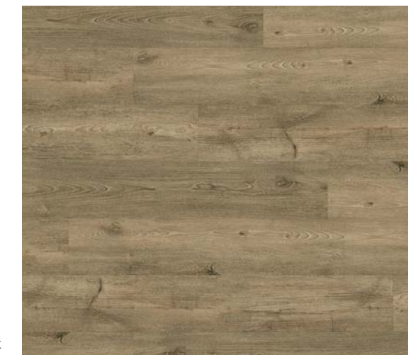
1716 Savannah Oak