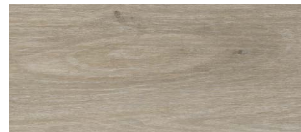
1736 Limed Essence