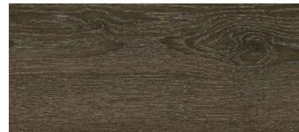
1738 Mocha Oak