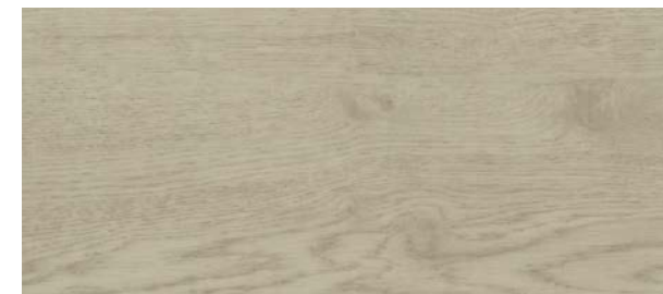
1714 Dove Grey