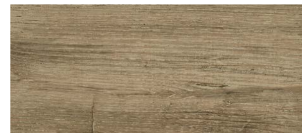
1716 Savannah Oak