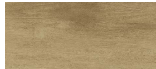
1725 Honey Grain