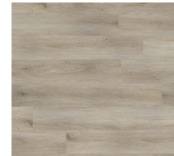
1736 Limed Essence