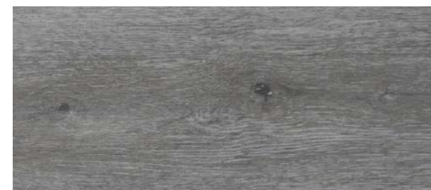
1712 Natural Grey

Created specifically with the needs of the interior designer in mind. We understand the importance of making a good first impression; and the ability to instantly create a stunning look that will stand the test of time.