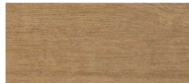
1718 Timeless Oak