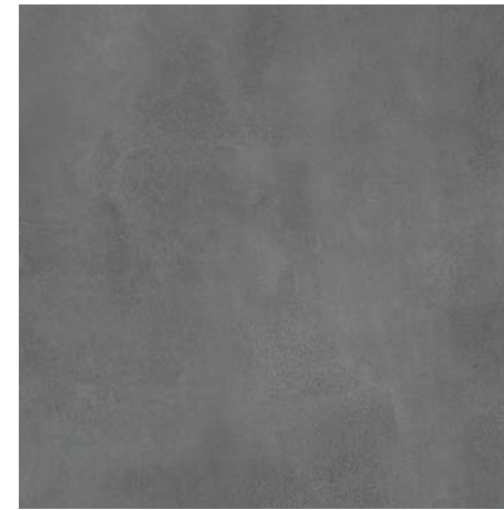
1747 Concrete Mist