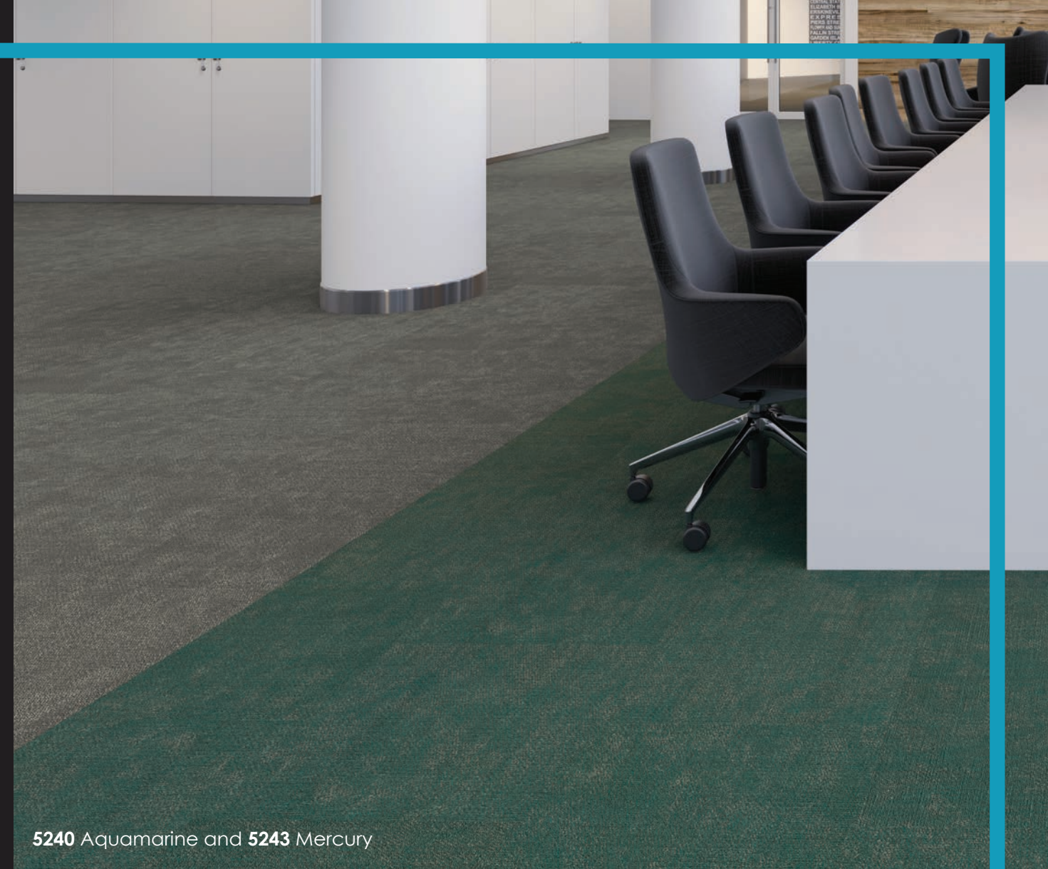
5240 Aquamarine and 5243 Mercury

Beautiful greys are accentuated with subtle pops of green, blues and yellow, while the simple two tone effects add depth and style.