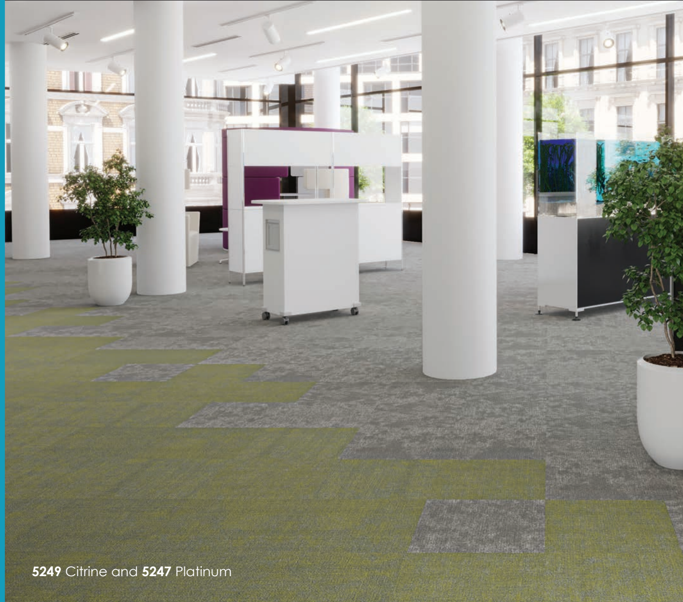
5249 Citrine and 5247 Platinum

This heavy duty commercial carpet tile comes with a 20 year commercial wear guarantee, demonstrating its hard wearing nature and suitability for high traffic areas.